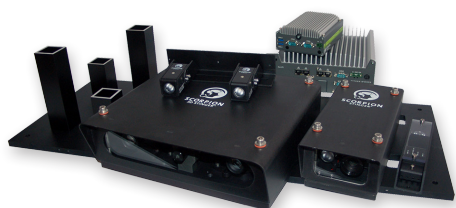
Scorpion Compact Vision