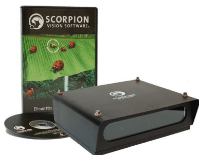
Scorpion 3D Stinger Camera

Scorpion Vision Software® offers a large reduction in the development time and deployment and maintenance cost for machine vision systems. Applications are customised smartly and expeditiously with the flexible user interface. Join us and see how!