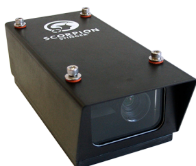
Scorpion2D Stinger Camera